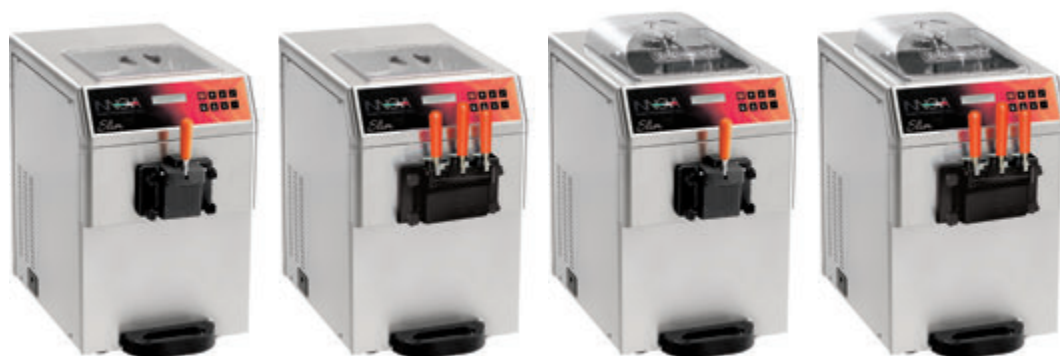
SLIM 1G SLIM 1GA